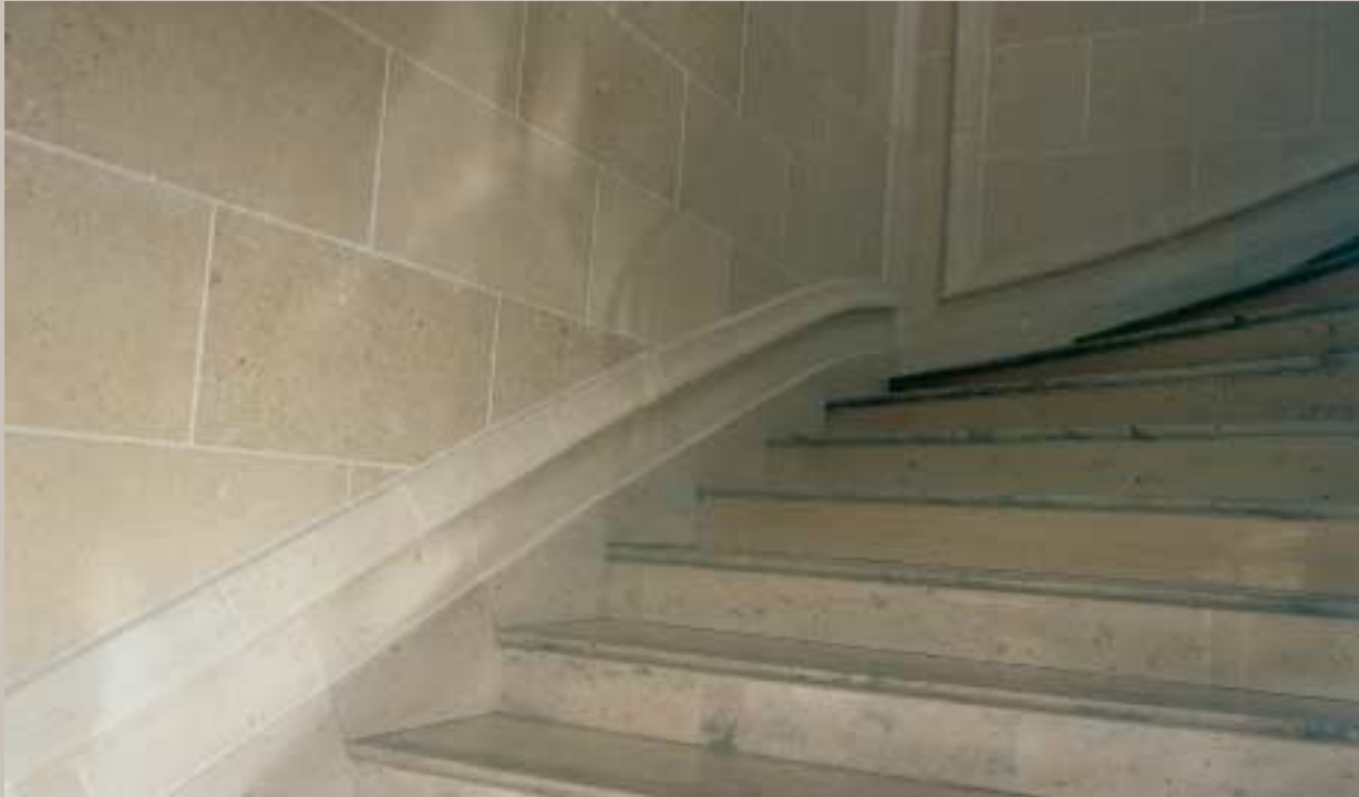
Rocamat Home Office - Ile Saint Denis.